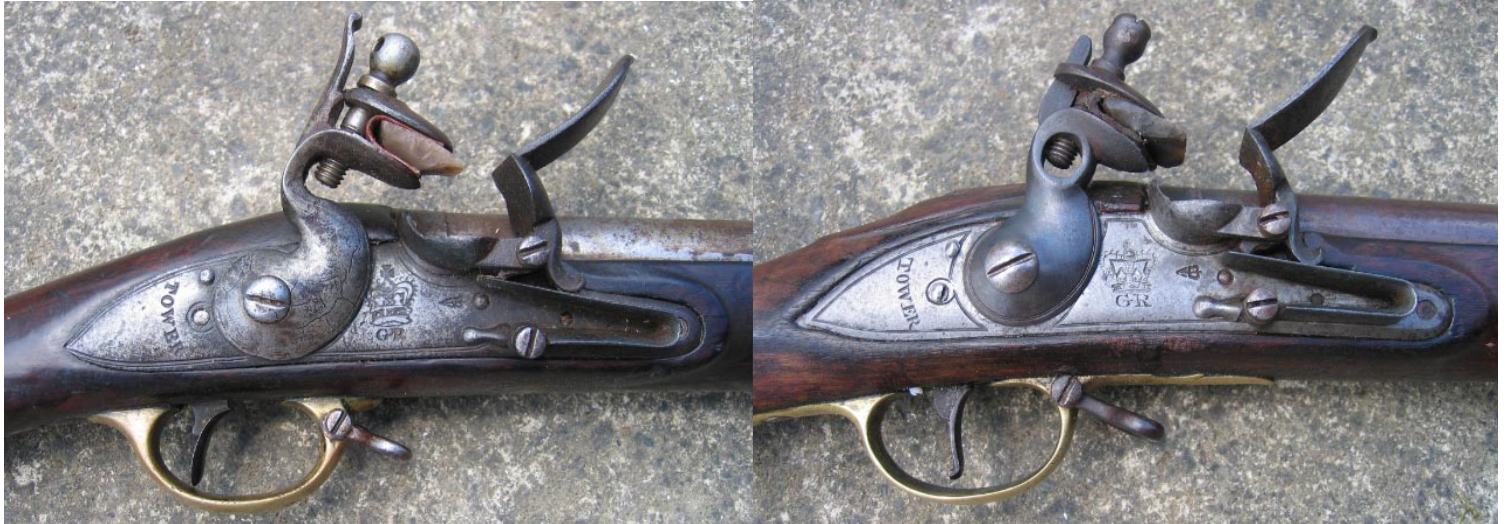
From c1759 Marine and Militia Pattern Brown Bess with goose neck cock From c1796 BM India Pattern Brown Bess with ring neck reinforced cock