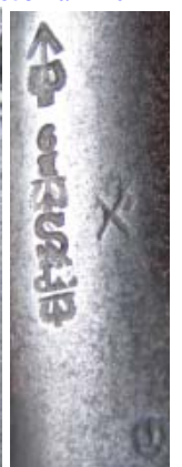
P1839 Victoria crown engraved on lock plate proof marks on barrel P1842 Victoria crown engraved on lock plate proof marks on barrel

The P1842 was also made in a rifled version and issued to the Royal Marines. It was similar to the P1842 smooth bore musket except for the rifling of three or four grooves and a caliber of .748" instead of .753". The barrel was fitted with a foresight and a leaf and ladder rear sight graduated to 1000 yards. In 1851 the New Zealand Colonial Government purchased 500, a mixture of Pattern 1839 and 1842 percussion smooth bore and P1842 rifle muskets and bayonets to replace some of their aging India Pattern flintlock muskets then in use by the Police and Militia Forces.