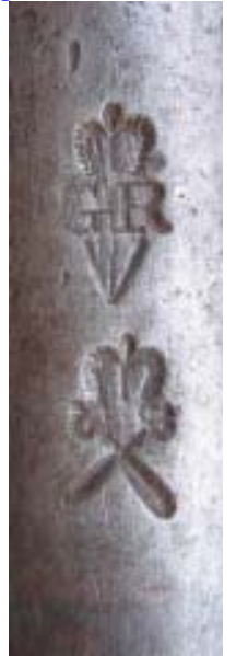
George III crown engraved on lock plate Proof marks stamped on barrel Later type George III crown proof marks stamped on barrel

By 1835 the North Island of New Zealand was saturated with firearms; in some areas each boy had two or three and men, ten firearms. Armies of up to 4,000 warriors carrying muskets attacked enemy tribes, making New Zealand a lawless country, frightening and formidable to the would be settlers.