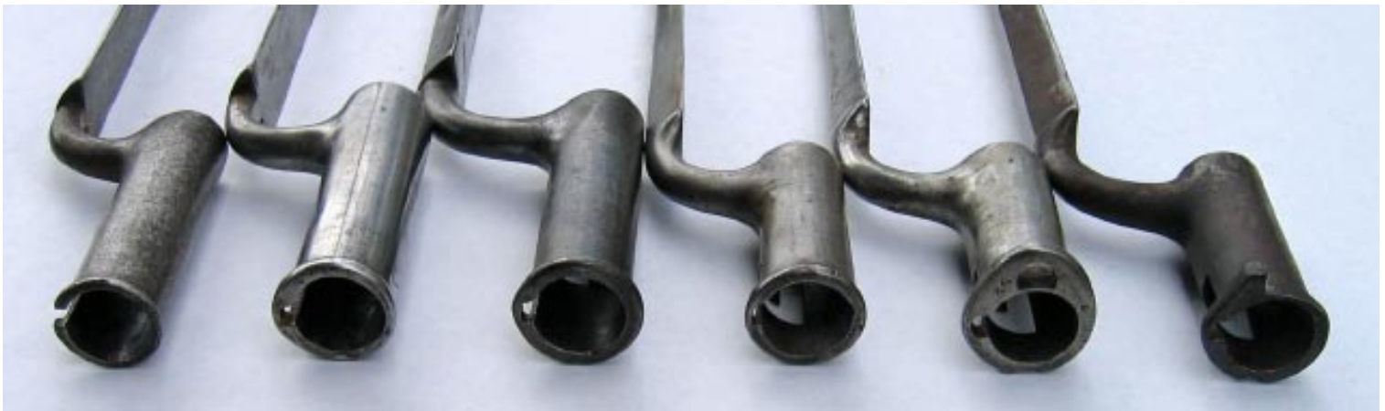
From top down in upper images and from left to right in lower image.