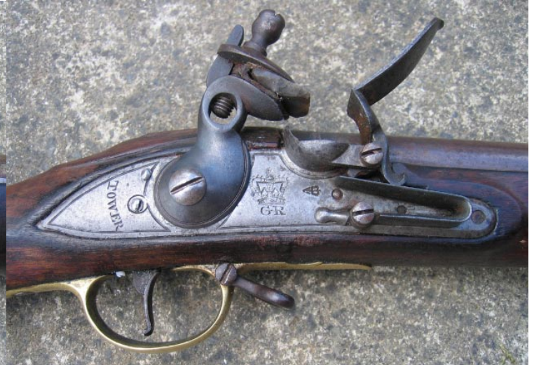
From c1759 Marine and Militia Pattern Brown Bess with goose neck cock From c1796 BM India Pattern Brown Bess with ring neck reinforced cock