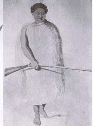
Left image; from a contemporary woodcut, Maori warriors armed with Brown Bess's dance the Haka (challenge) before attacking enemy tribes. Note leather flap covered wooden cartridge boxes on waist belts. In the distance a large waka taua (war canoe) arrives with another Maori war party. Centre image; Paramount Maori Chief Hone Heke armed with Brown Bess, with his wife Hariata and the Great Chief Te Ruki Kawiti, designer of Ruapekapeka Pa (Maori Fort). Heke and Kawiti were the leaders of the rebellion in the north, and opposed British Colonisation of New Zealand Right image; Paramount Maori Chief Tamati Waka Nene with his Brown Bess, major supporter of British Colonisation of New Zealand and with his army fought on the side of the British. Nene did more than any other Maori to promote colonisation and to establish the Queens authority.