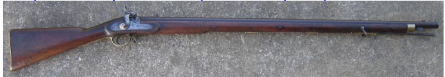
c1842 Pattern. New British Military design percussion musket incorporating all the best design features available. New Lock assembly, this one fitted with a pattern 1853 hammer with straight cocking ear. Refer image below for lock and proof markings. Also rifled for use by the Royal Marines.