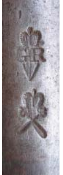
George III crown engraved on lock plate Proof marks stamped on barrel Later type George III crown proof marks stamped on barrel

By 1835 the North Island of New Zealand was saturated with firearms; in some areas each boy had two or three and men, ten firearms. Armies of up to 4,000 warriors carrying muskets attacked enemy tribes, making New Zealand a lawless country, frightening and formidable to the would be settlers.