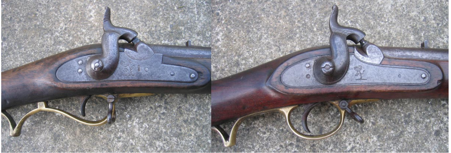
c1833? BEIC flintlock musket converted to percussion from c1837?

The Indian rebellion of 1857 brought about the end of the British East Indian Company’s rule in India, and led to direct rule by the British Government (British Raj). The BEIC Military became part of the British forces in 1858