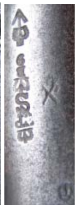
P1839 Victoria crown engraved on lock plate proof marks on barrel P1842 Victoria crown engraved on lock plate proof marks on barrel The P1842 was also made in a rifled version and issued to the Royal Marines. It was similar to the P1842 smooth bore musket except for the rifling of three or four grooves and a caliber of .748" instead of .753". The barrel was fitted with a foresight and a leaf and ladder rear sight graduated to 1000 yards. In 1851 the New Zealand Colonial Government purchased 500, a mixture of Pattern 1839 and 1842 percussion smooth bore and P1842 rifle muskets and bayonets to replace some of their aging India Pattern flintlock muskets then in use by the Police and Militia Forces.