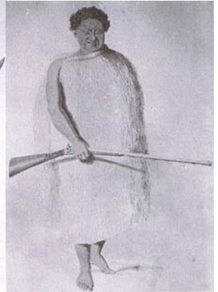
Left image; from a contemporary woodcut, Maori warriors armed with Brown Bess's dance the Haka (challenge) before attacking enemy tribes. Note leather flap covered wooden cartridge boxes on waist belts. In the distance a large waka taua (war canoe) arrives with another Maori war party. Centre image; Paramount Maori Chief Hone Heke armed with Brown Bess, with his wife Hariata and the Great Chief Te Ruki Kawiti, designer of Ruapekapeka Pa (Maori Fort). Heke and Kawiti were the leaders of the rebellion in the north, and opposed British Colonisation of New Zealand Right image; Paramount Maori Chief Tamati Waka Nene with his Brown Bess, major supporter of British Colonisation of New Zealand and with his army fought on the side of the British. Nene did more than any other Maori to promote colonisation and to establish the Queens authority.