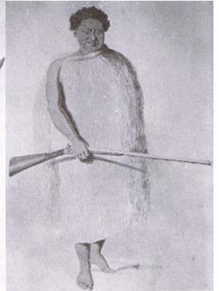
Left image; from a contemporary woodcut, Maori warriors armed with Brown Bess's dance the Haka (challenge) before attacking enemy tribes. Note leather flap covered wooden cartridge boxes on waist belts. In the distance a large waka taua (war canoe) arrives with another Maori war party. Centre image; Paramount Maori Chief Hone Heke armed with Brown Bess, with his wife Hariata and the Great Chief Te Ruki Kawiti, designer of Ruapekapeka Pa (Maori Fort). Heke and Kawiti were the leaders of the rebellion in the north, and opposed British Colonisation of New Zealand Right image; Paramount Maori Chief Tamati Waka Nene with his Brown Bess, major supporter of British Colonisation of New Zealand and with his army fought on the side of the British. Nene did more than any other Maori to promote colonisation and to establish the Queens authority.