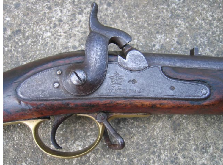
Pattern 1838/9 percussion musket made up from P1837 flintlock parts