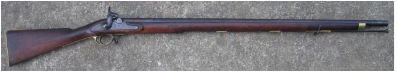
c1837 Originally referred to as the Standard British Military Victorian Flintlock Musket incorporating some of the BEIC flintlock musket design changes, still with a 39" barrel, Converted to percussion and commonly referred to as the 1838 pattern percussion musket. All new parts awaiting assembly were modified and made up into a new percussion musket known as the 1839 pattern. Barrel secured to stock with three wedges, rear sight added, rear ramrod pipe moved forward, bayonet retaining spring catch fitted to end of fore-wood. New redesigned lock assembly with new shape hammer copied from BEIC. Stock shape similar to BEIC. Refer image below for lock and barrel proof markings.